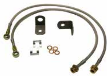
Stainless Steel Brake Lines